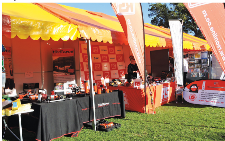
The 12th Annual Mining and Technical Exhibition in Rustenburg.

SPRAY PAINTER NEEDED: Must have at least 5 years experience. Colour mixing ability is essential. Salary negotiable - References essential. Valid South African I.D. No foreigners. Clean tidy work ethics. Non affirmative position.