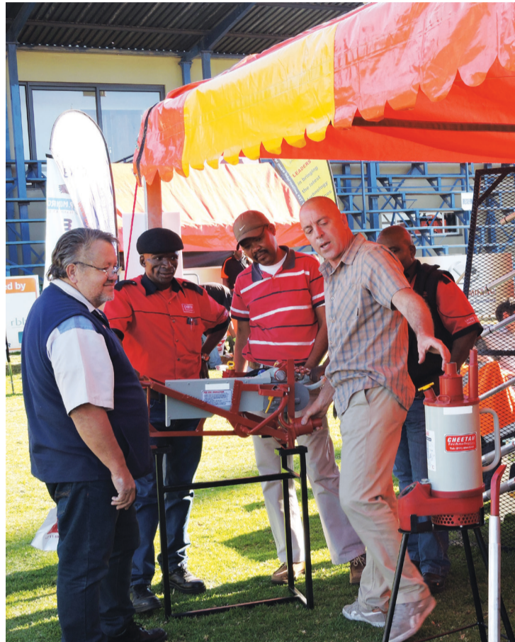
Cheetah Technologies showcasing their latest products to potential buyers – one of many stalls at the Rustenburg Mining Expo.