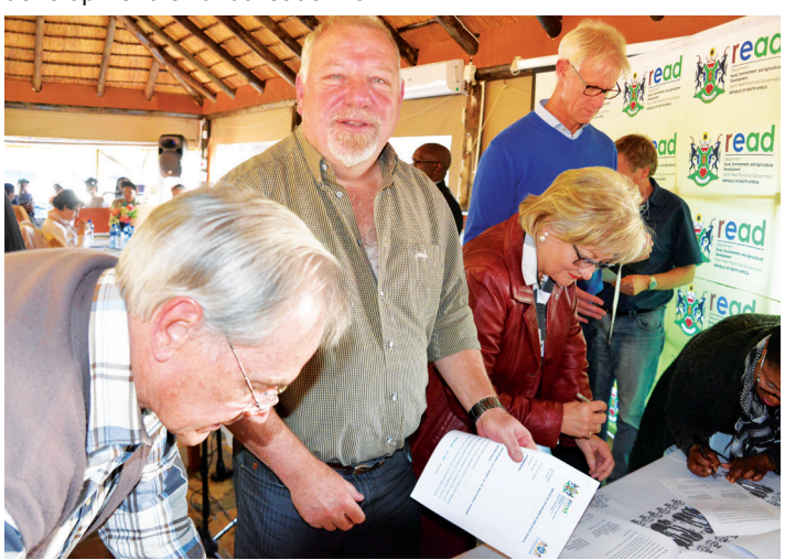
Jovial faces as new board members for Magaliesberg Biosphere Reserve accept their appointment.

Members are still to elect the Chairperson of the Board during their formal meeting of the management authority.